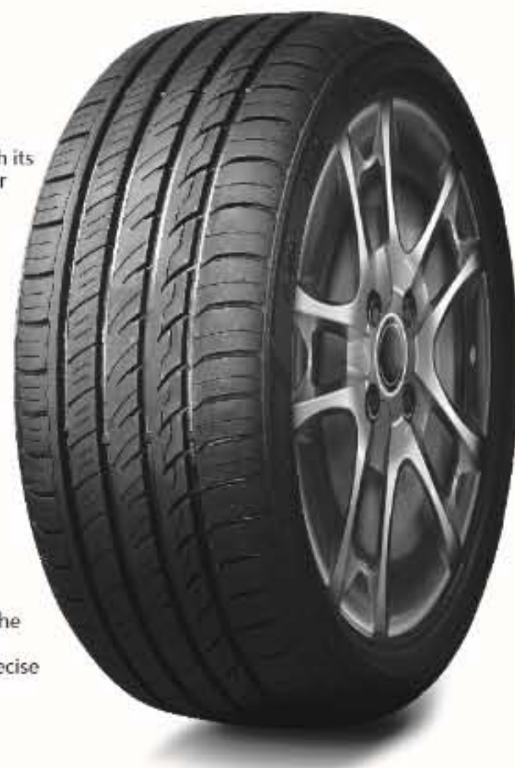
U.T.Q.G TREADWEAR:400 TRACTION:A TRMPEATURE:A