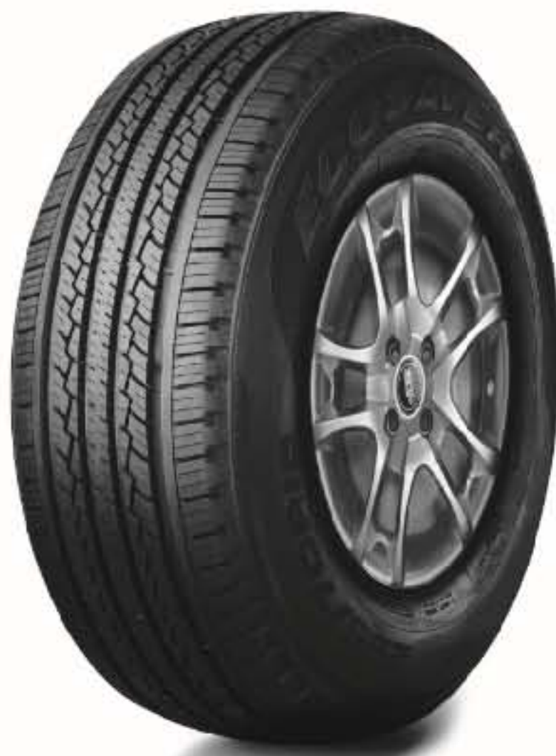
U.T.Q.G TREADWEAR:400 TRACTION:A TRMPEATURE:A